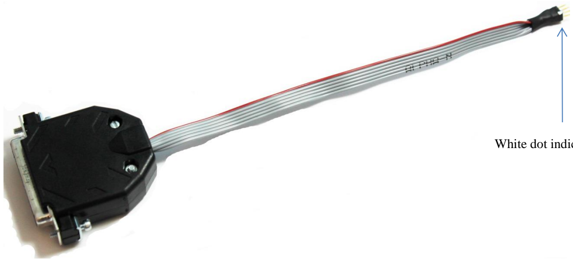
White dot indicates Pin 1