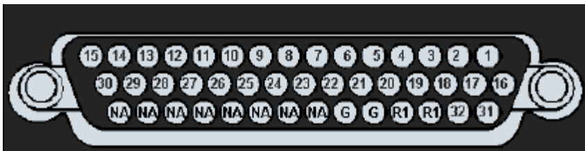
Female DB44 connector