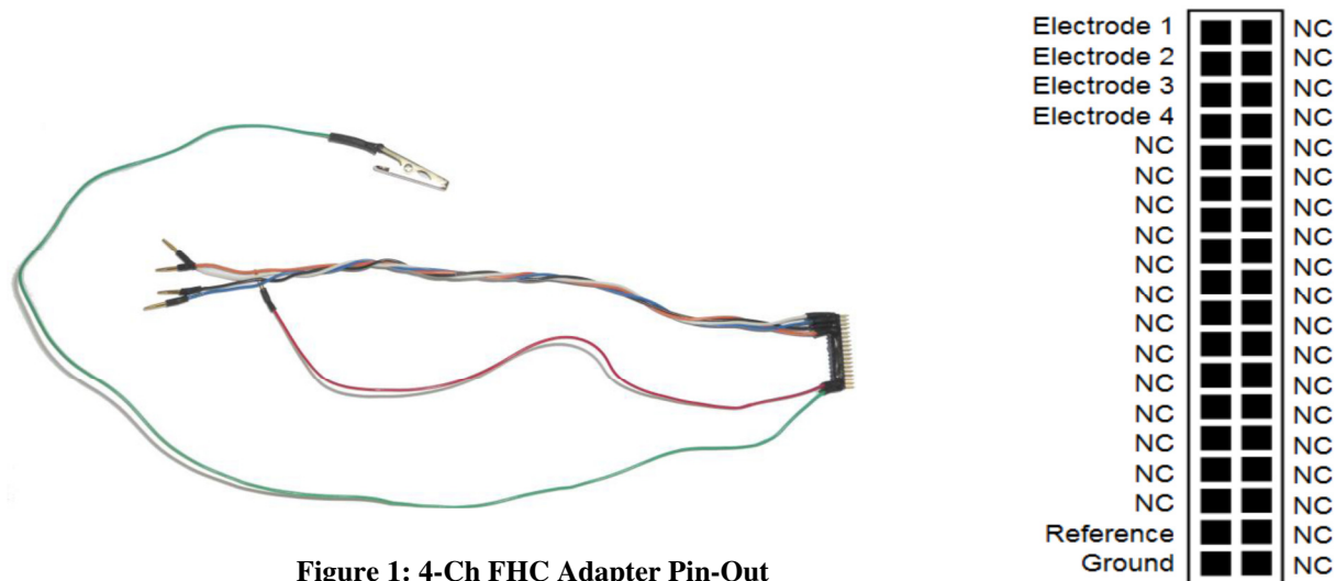
Figure 1: 4-Ch FHC Adapter Pin-Out

*The NC pins on the connector are not connected and are shorted to GND.